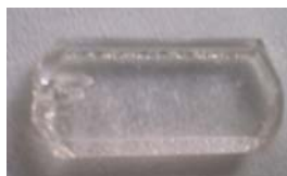
Fig. 1. Photograph of grown \text{Si}_{0.99}\text{Sn}_{0.01}\text{O}_2 crystal obtained after 7 days, using a temperature gradient of 70 °C, dissolution temperature 420 °C and pressure 1000 bar.

Single crystals of length 50 mm (Fig. 1) with the tin content 0.5 and 1 % were grown. Because the solubilized state under hydrothermal conditions remains obscure in many respects, all growth parameters (dissolution temperature, growth temperature, pressure and mineralizer concentration) were studied in terms of tin substituted in the \text{SiO}_2 structure. For all the samples of \text{Si}_{1-x}\text{Sn}_x\text{O}_2 single crystals, it was obtained a single \alpha -quartz phase (Fig. 2).